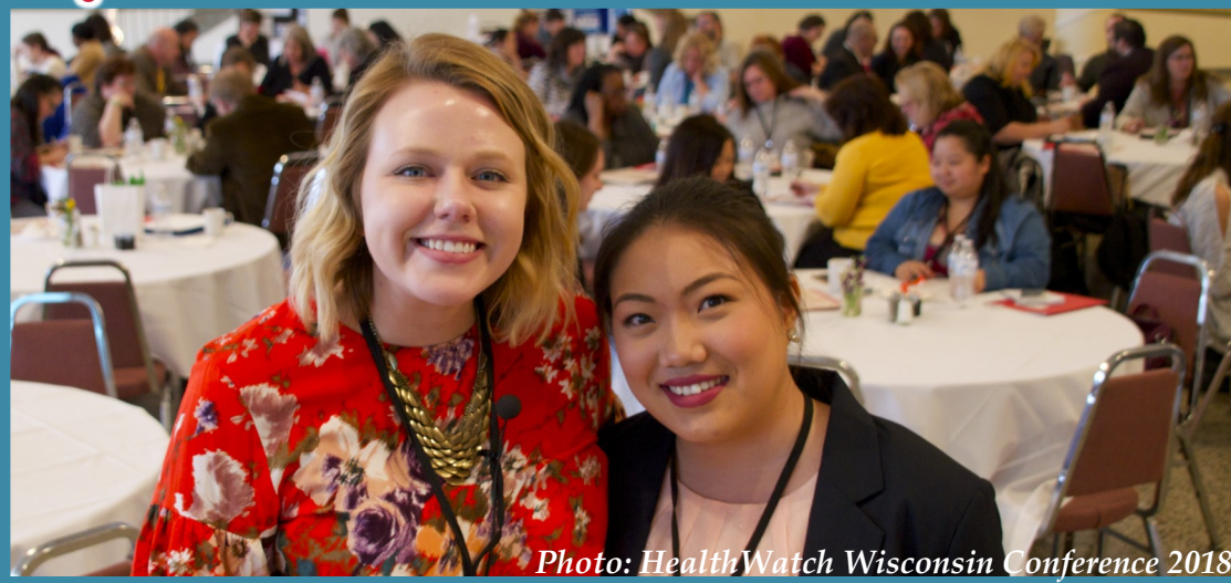
Photo: HealthWatch Wisconsin Conference 2018